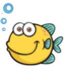
Feliz the Flounder