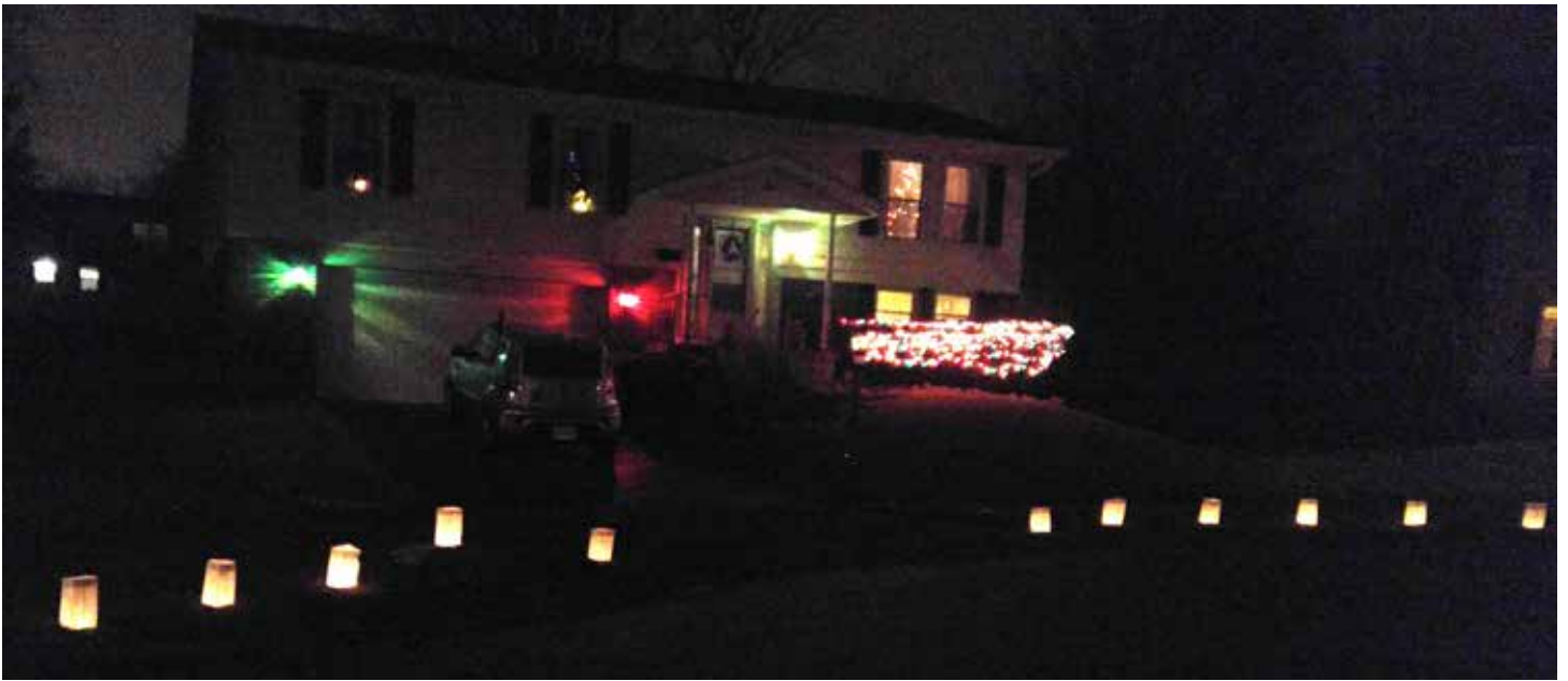
A Forest Ridge home with Luminaries on Christmas Eve