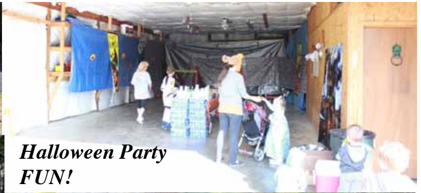
Halloween Party FUN!